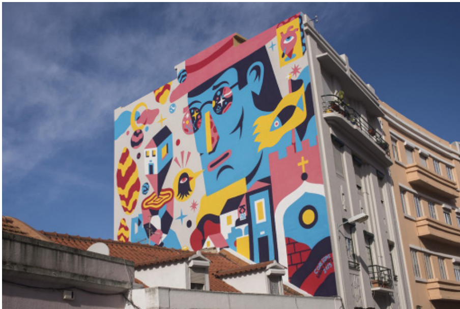
Desassosego, Lisboa, Portugal, 2015