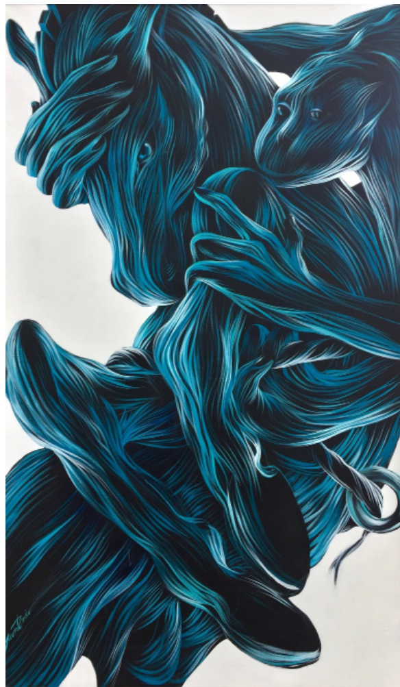
Calma bicho, 2014 - 2018