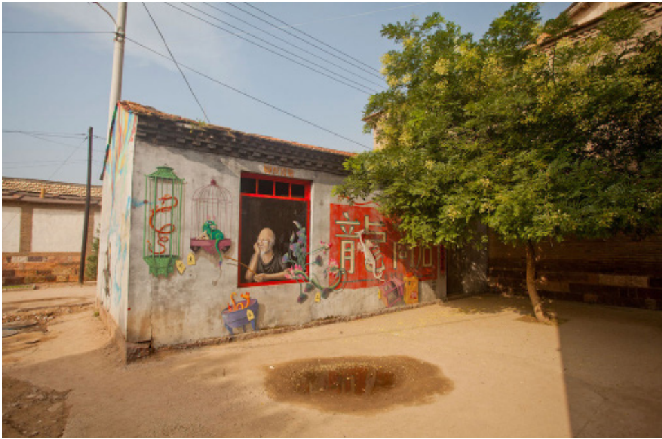
Village of Shanxi, China