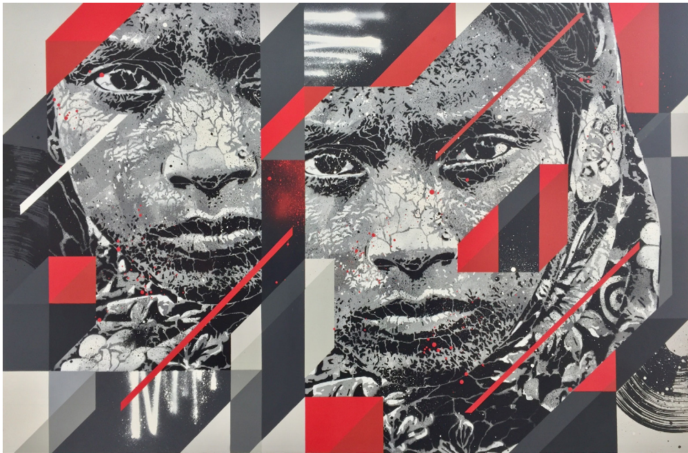
TESSELLATE 80120 #1, 2018