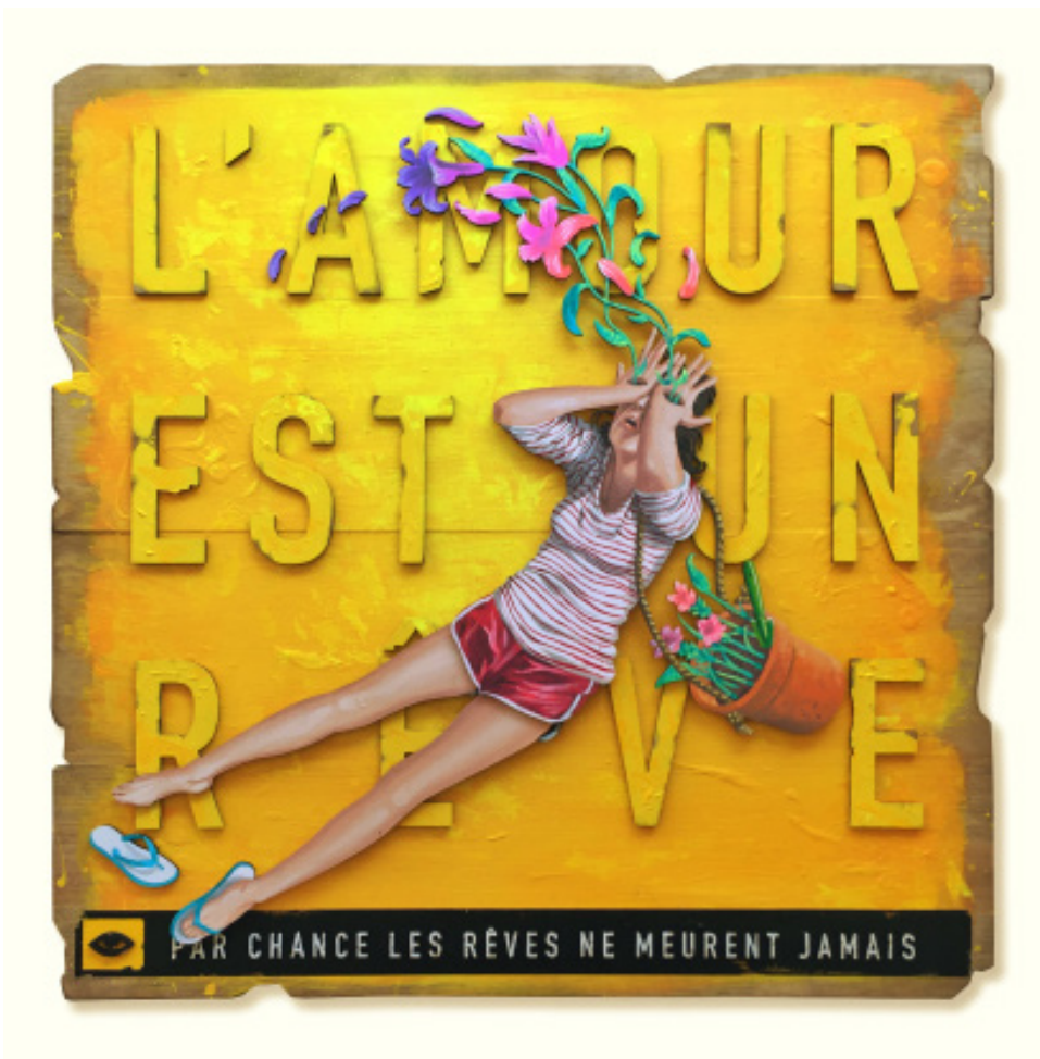
Love is a dream (By chance dreams never die), 2018