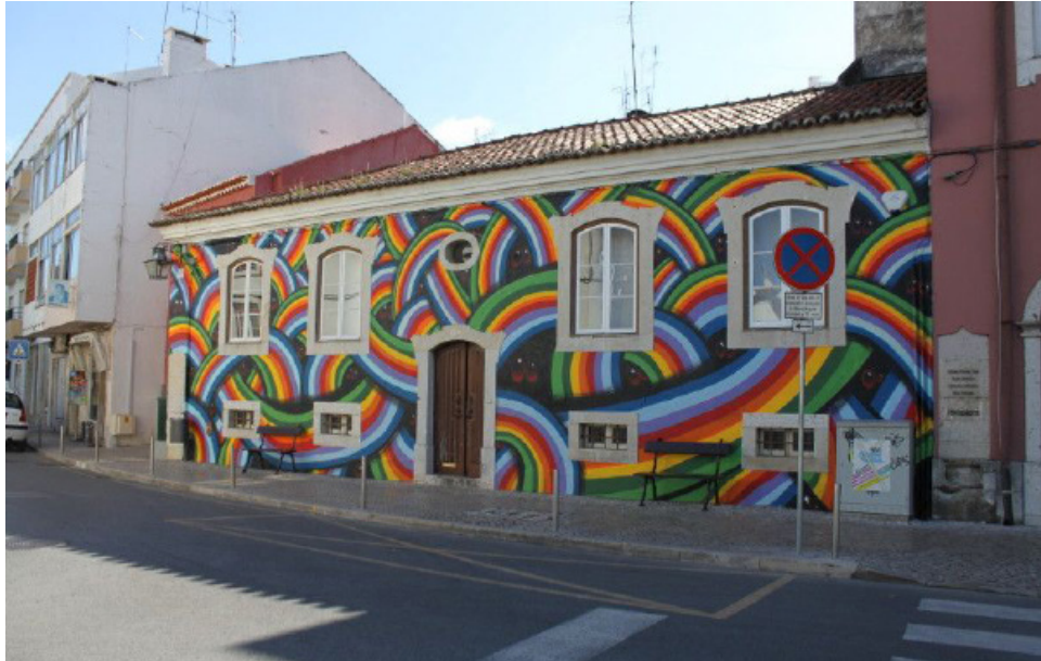
Rainbow Garden, Portugal, 2011