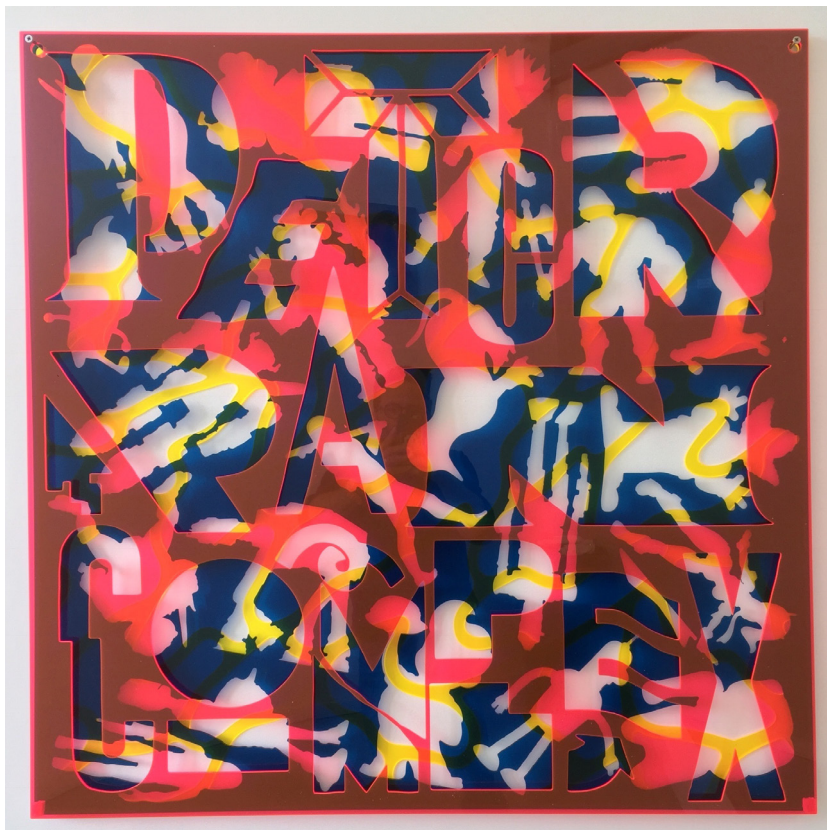
Peter pan complex, 2018