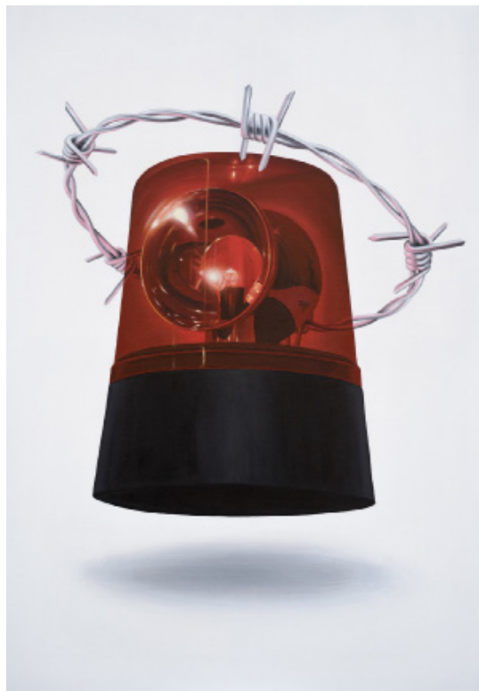
Siren X Barbed Wire, 2017