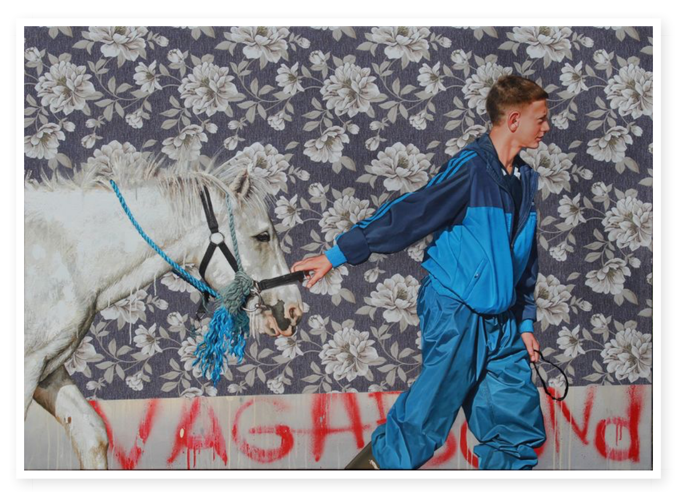
Matthias Mross - Vagabond, 2019

To capture this unique horse culture, Mross combined a range of materials , from spray cans and acrylic paint to markers, brushes, spatulas, collages, and iron foil. Combining elaborate layers of paint on repeating floral motifs or particular fabrics, the artist created works of truly remarkable detail .