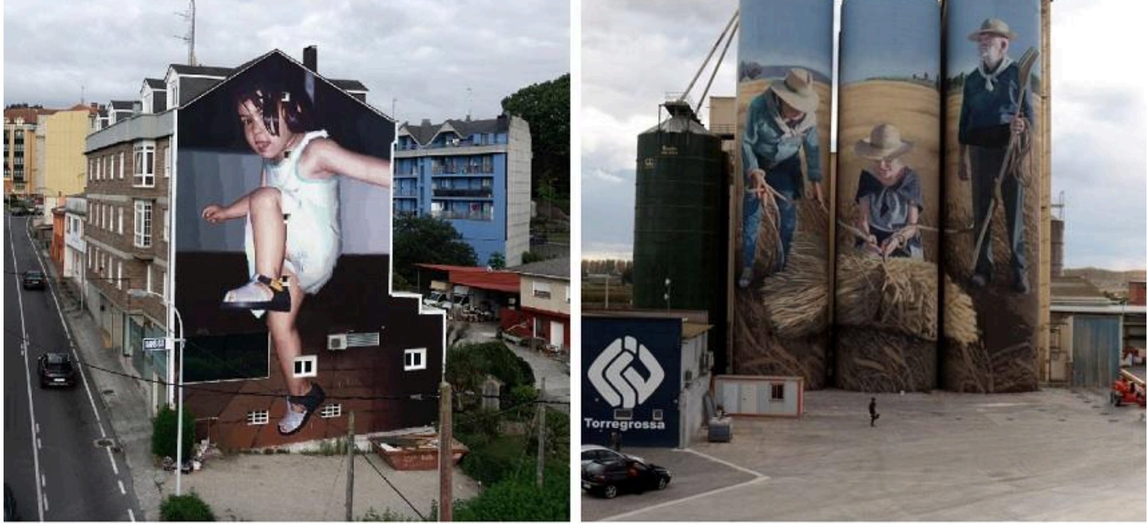
Left: Nil Safont - The Danse / Right: Nil Safont - Tied Up

The exhibition is a reflection on the limits, particularly the limits between the domestic and public space , home and street, interior and exterior. The everyday scenes transport us to various daily situations, enhancing the perceived and invisible limits that may or may not be similar to ours.